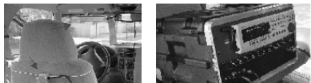
Figure 3: Microphone array and reference microphone (left), Fostex multi-channel data recorder (right).

A five-channel microphone array has been constructed using Knowles microphones and a multi-channel data recorder housing built (Fostex) for in-vehicle data collection. An additional reference microphone is situated behind the driver’s seat. Fig. 3 shows the constructed microphone array and data recorder housing.